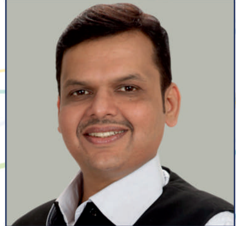
Hon. Shri. Devendra Fadnavis Dy. Chief Minister, Maharashtra State