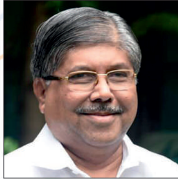
Hon. Shri. Chandrakant Patil Minister, Higher & Technical Education, Government of Maharashtra