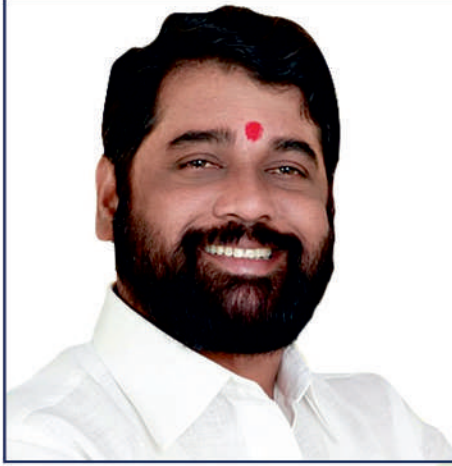
Hon. Shri. Eknath Shinde Chief Minister, Maharashtra State