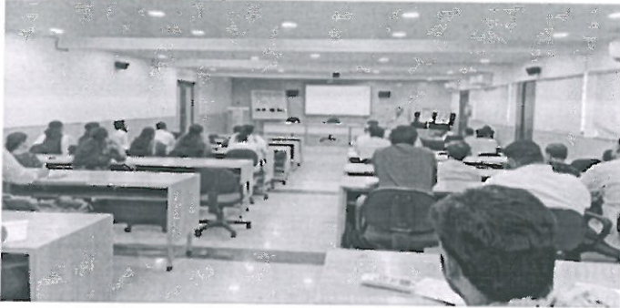
Session-I: Introduction to NBA Accreditation