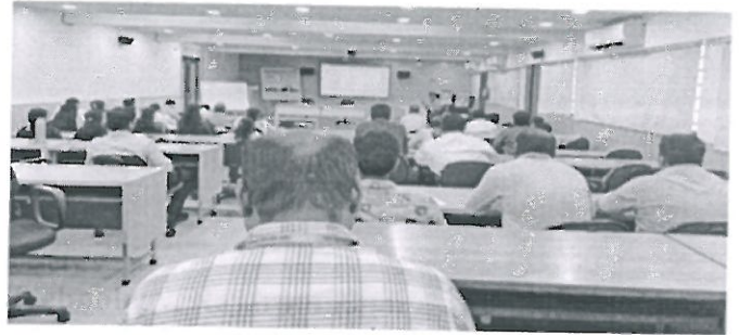
Session-II: Orientation through NBA UG criteria 1, 2, 3 and 7