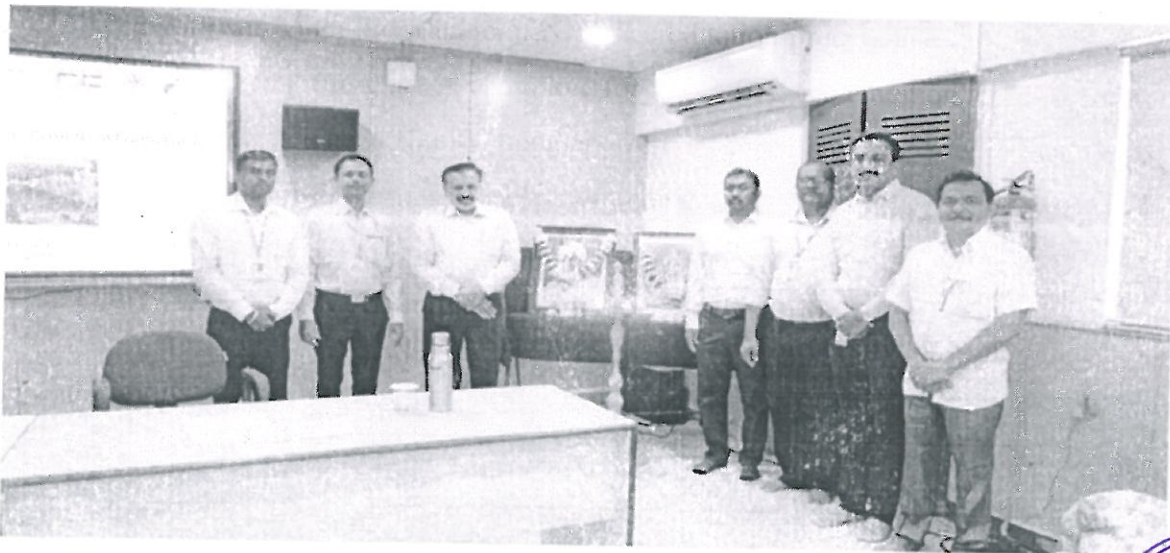
Inauguration function of one-day seminar on Orientation through NBA Accreditation Framework