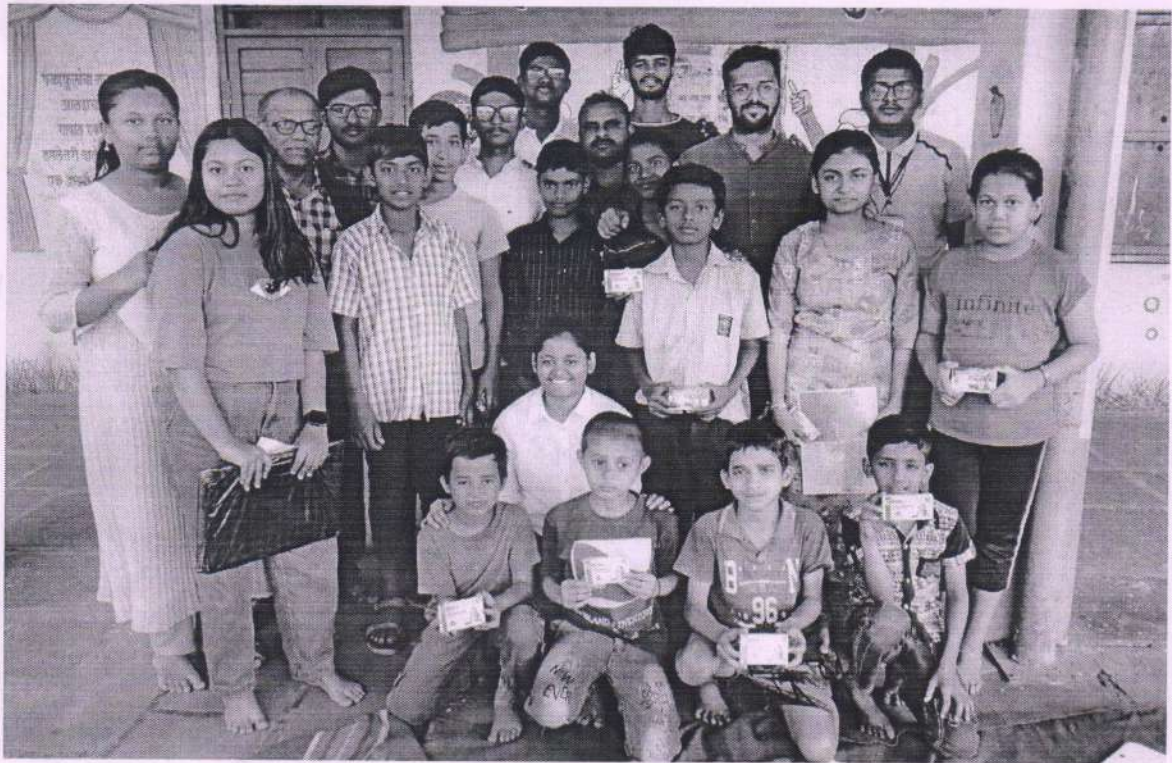
Drawing Competition winners.