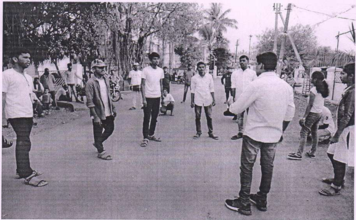
Street play by students on 'SAVE WATER SAVE NATION'