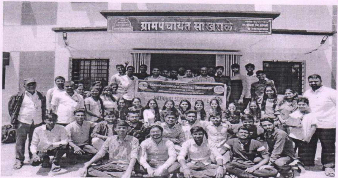
NSS Volunteers with faculties.