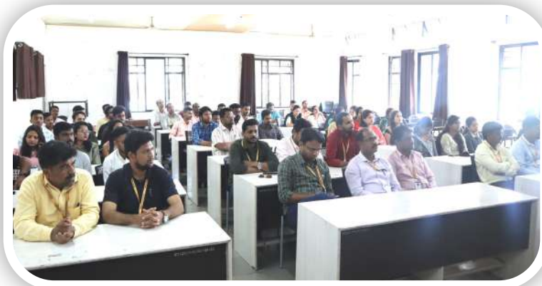
Alumni & Faculty present for the Program