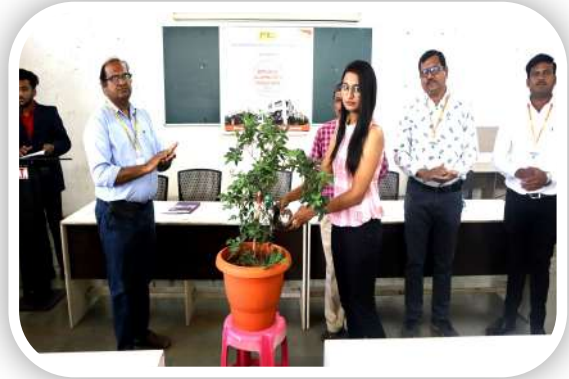
Watering the Plant by Guests